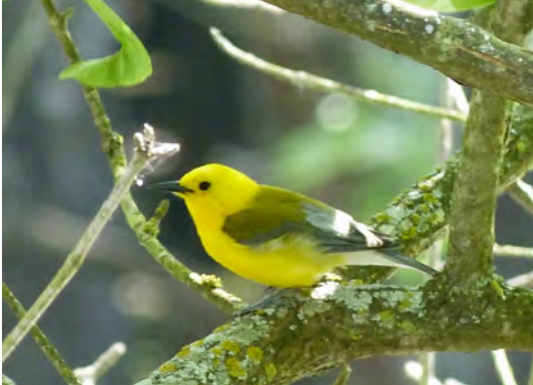
Prothonotary Warbler

The City Nature Challenge is a global, city-scale urban biodiversity BioBlitz. This year's event was a world-wide collaborative effort rather than a competition.