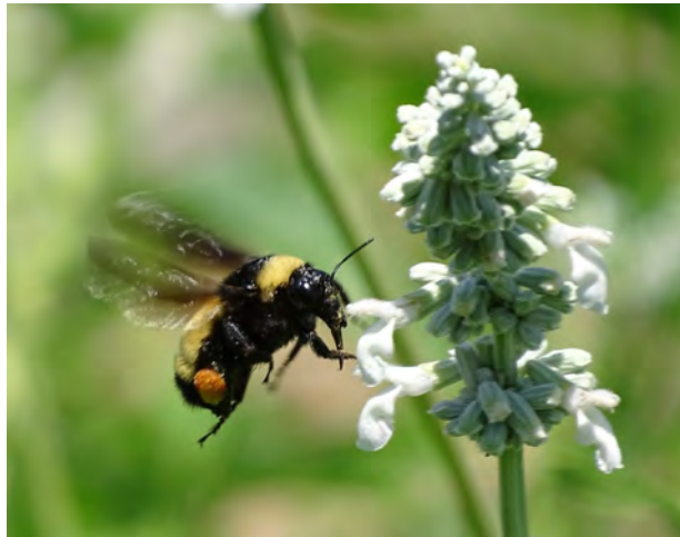
American bumble bee , Elaine White, iNaturalist, CCBY-NC