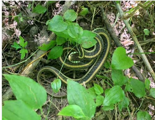
Texas garter snake