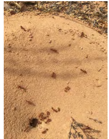
Comanche harvester ant , charley, iNaturalist, CCBY-NC

The City Nature Challenge is organized by the Natural History Museum of Los Angeles County and the California Academy of Sciences. More information at citynaturechallenge.org