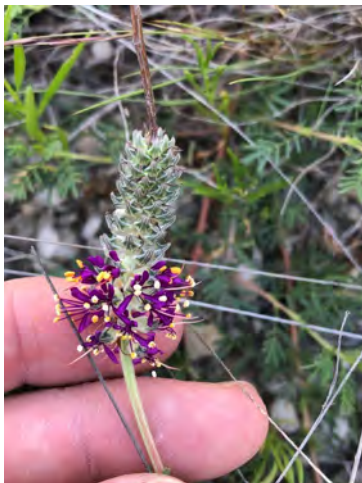
Comanche Peak prairie clover